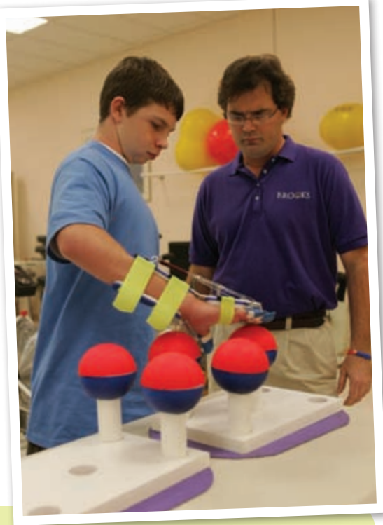
Treatment using the Saeboflex device is one of many services offered at the Brooks Center for Neurological Rehabilitation.

Brooks Center for Neurological Rehabilitation is appropriate for patients with the following diagnoses: